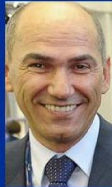
Janez Janša 2 years for corruption