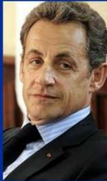
Nicolas Sarkozy charged with corruption