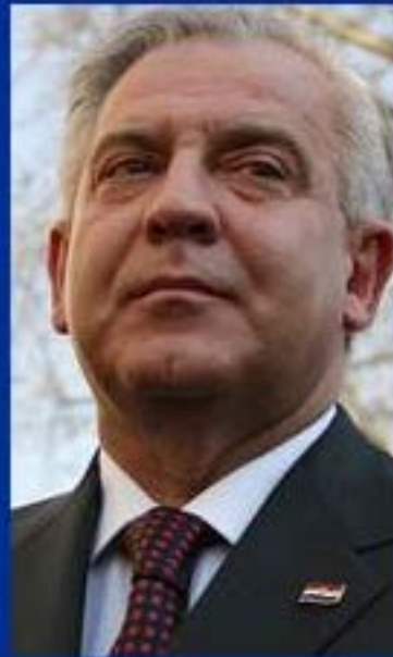
Ivo Sanader 8,5 years for corruption