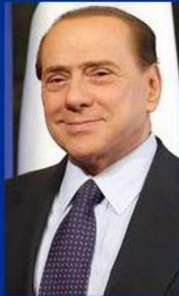
Silvio Berlusconi 4 years for tax-fraud