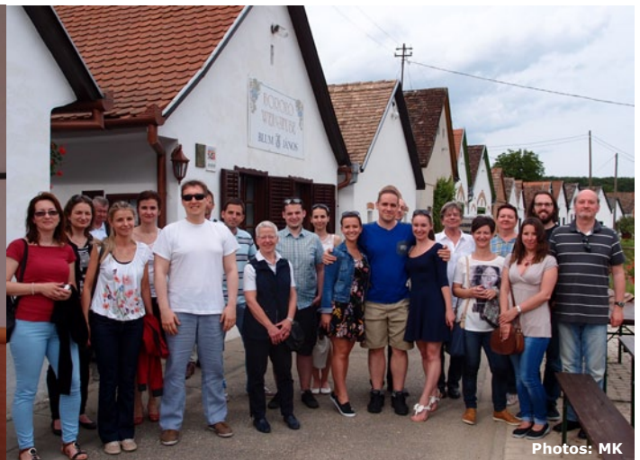
Wine-tasting at Villánykövesd