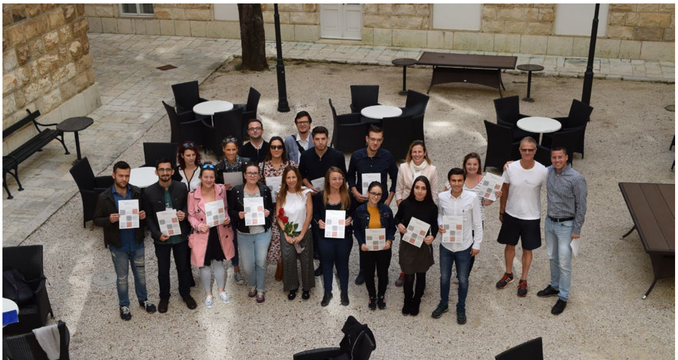
Participants of the course "Crime and Criminology in the Balkans" at the Inter-University Centre in Dubrovnik