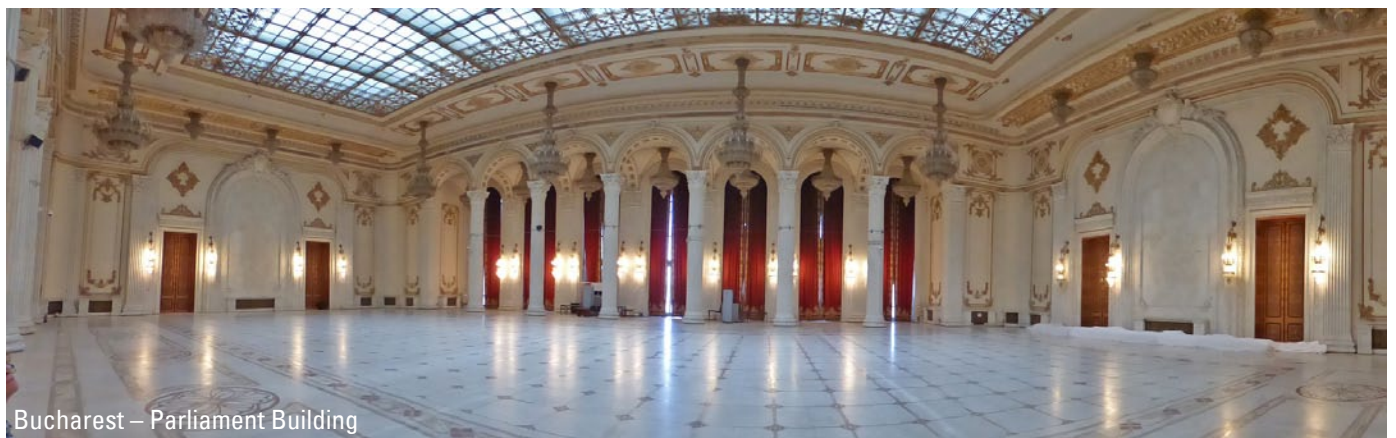
Bucharest – Parliament Building

These events will provide excellent opportunities for a prominent representation of Balkan Criminology. The Max Planck Partner Group for Balkan Criminology fully supports the organizers of these two events. We are certain that they will contribute to the strengthening of the scientific research and cooperation in the region, and its visibility in Europe and the rest of the world.