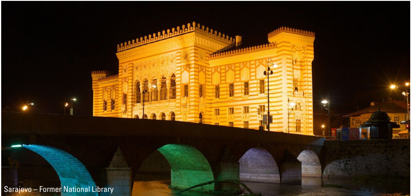
Sarajevo – Former National Library